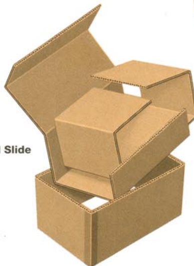
Double Lined Slide