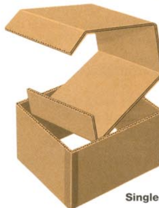
Single Lined Slide